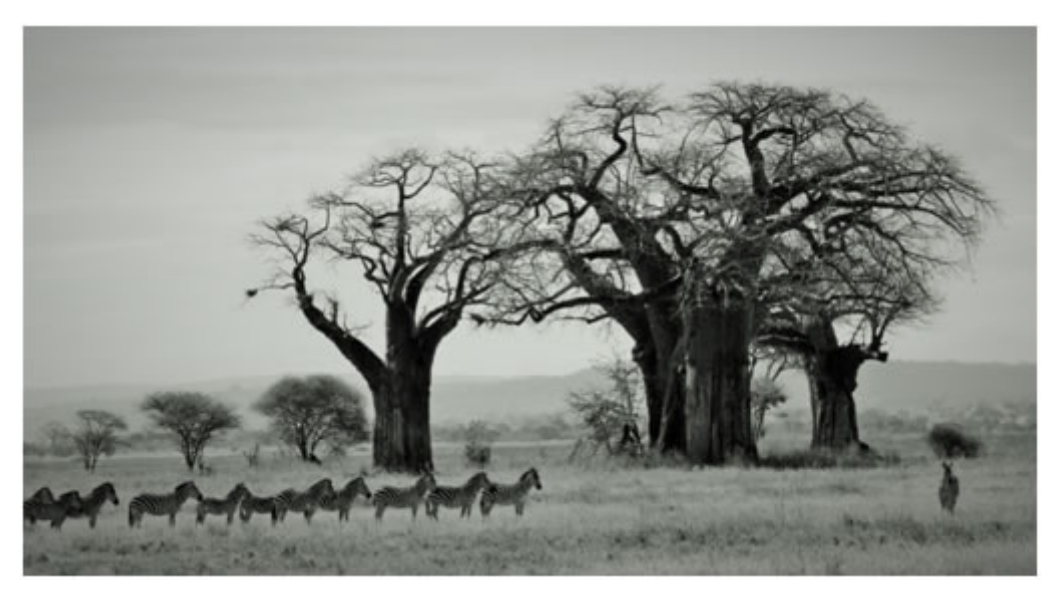
Zebra during sunset

This is meant to be a "free and easy" adventure trip. Participants should be relatively fit, with a good sense of humour, and above all, have the <u>right attitude</u> for close travel with others through possibly some trying times. Most definitely, this is not a trip for prudes, whiners, fuss-pots, and other similiarly assorted types! We had a couple of those before and it wasn't pleasant for us or them. Although every effort will be made to stick to the given itinerary, ground conditions may change and cause some disruption and/or deviation from the norm. Otherwise, have fun!