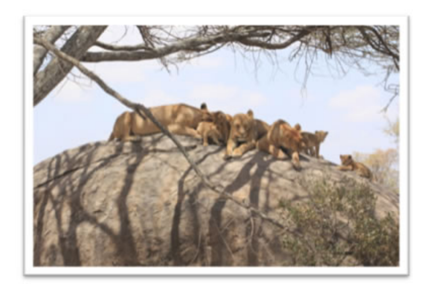
Lion taking nap at noon time

<u>Day 5 (24 Jul): Lake Naivasha - Amboseli NP:</u> After breakfast drive to Amboseli National Park arrive in time for lunch and short rest at Sentrim Amboseli camp. We will then go out for the afternoon game drive to enjoy game viewing against the majestic backdrop of snow-capped Mt Kilimanjaro. O/N Amboseli.